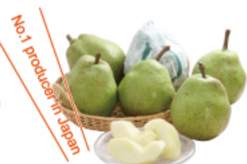
La France Pears Mid November – mid December

When the north wind starts to blow, the apples turn red and sweet.