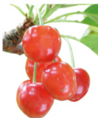
Cherries Early June – mid July

Ruby red and shiny cherries are full of flavor! That's our Tendo pride.