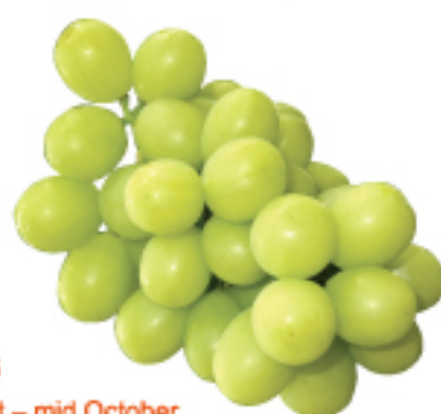
Grapes Mid August – mid October

La France pears are known as the queen of fruits in Japan because of their mellow and aromatic flavor. Tendo is the largest producer of La France pears in Japan.