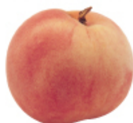
Peaches Mid July – late August

Juicy grapes are filled with flavor. The finest varieties of grapes, such as shine muscat, are cultivated.