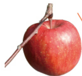
Apples Early September – late November

When the north wind starts to blow, the apples turn red and sweet.